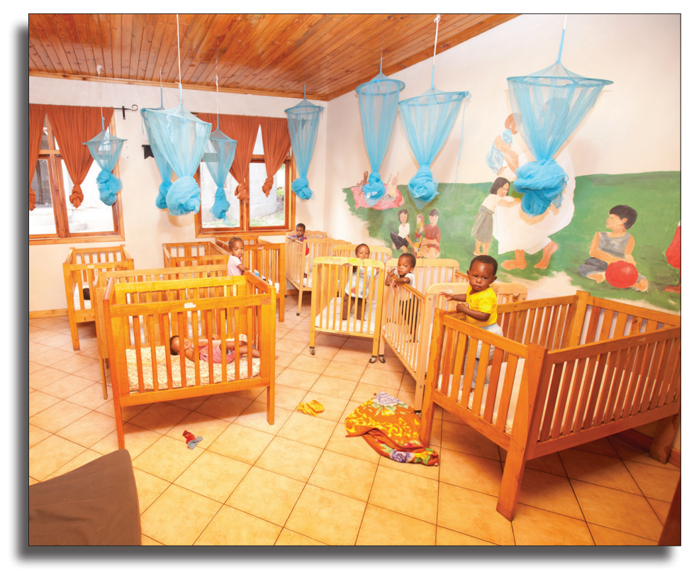
Bedroom, Babies in Cozy Cots

We have a full-time nurse on staff who watches for any signs of illness every day. She also weighs babies who are under-weight or on special diets. The medical room is equipped with charts, medical supplies and scales. If a child is not improving, he/she is quickly taken to a local medical center for treatment by a Medical Assistant or Doctor.