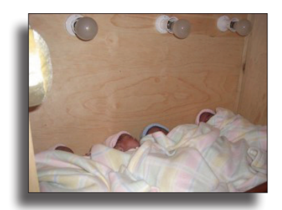
Ready to leave the hospital